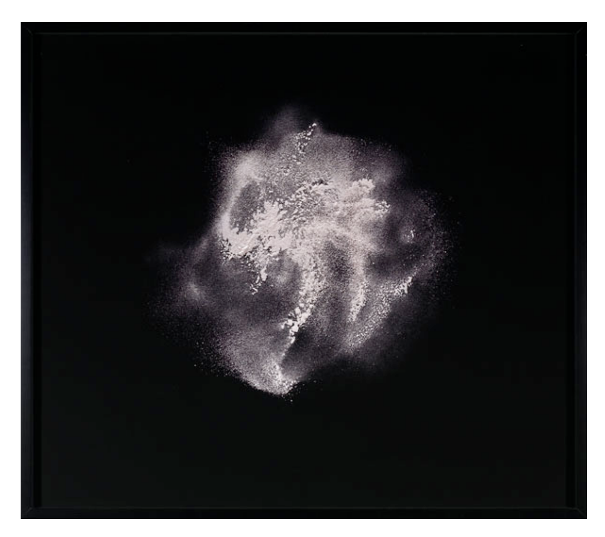
Galen # 4. (part of Deuil I), 2006.