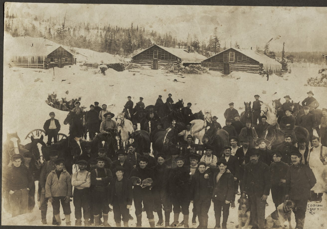
Eddy Bros Lumber Camp, Blind River.