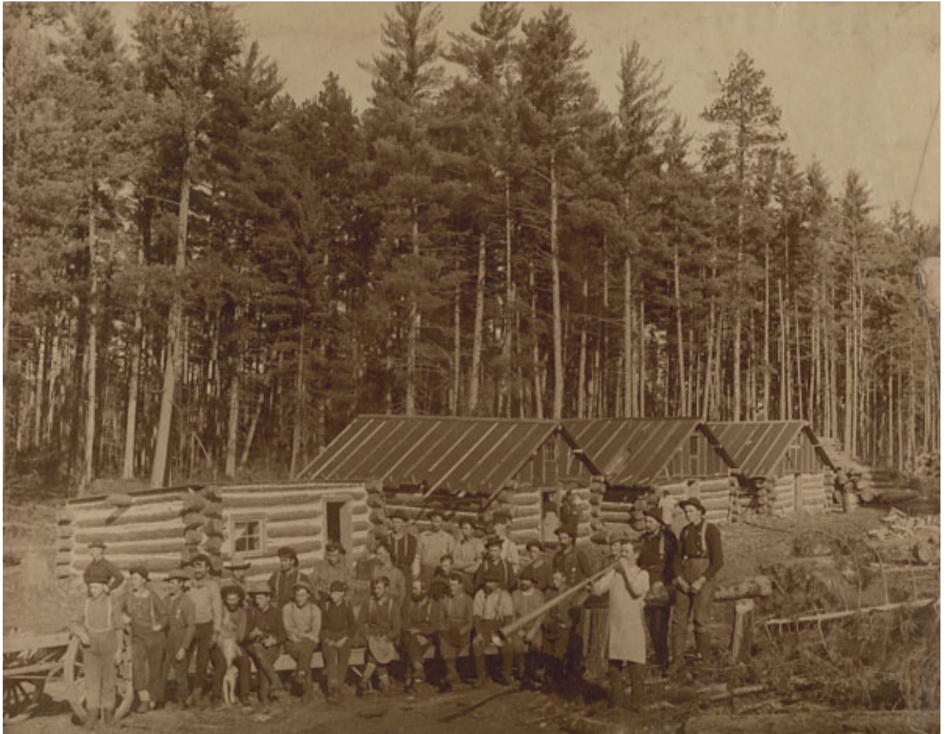
The Lumber Camp at Blind River. Ca. 1910-1920.

Silver gelatin print on brown cardboard support ; 18.1 x 24.9 cm on support 30.0 x 35.0 cm.