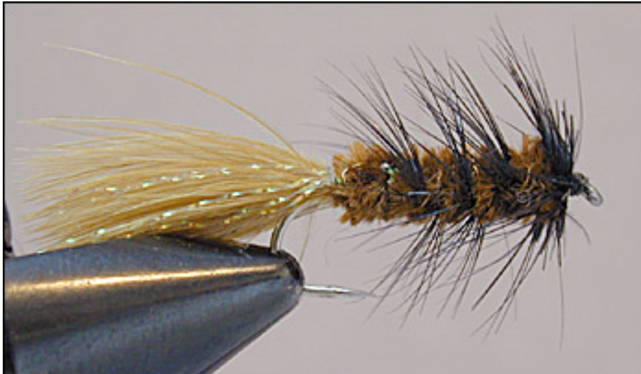
Image from http://www.west-fly-fishing.com/fly-pattern-recipe/wet/woollybugger.shtml