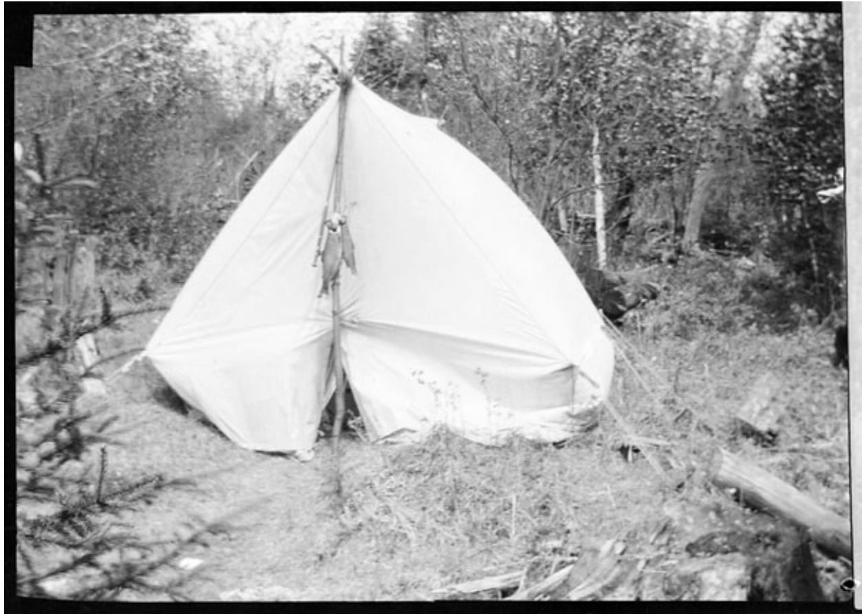
Two Trout Hanging from the Tent Pole. 1914