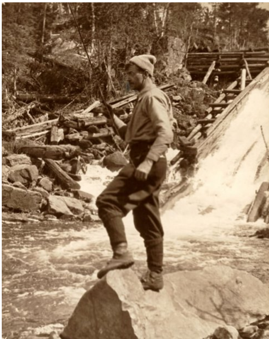
Tom Thomson Fishing. Date unknown